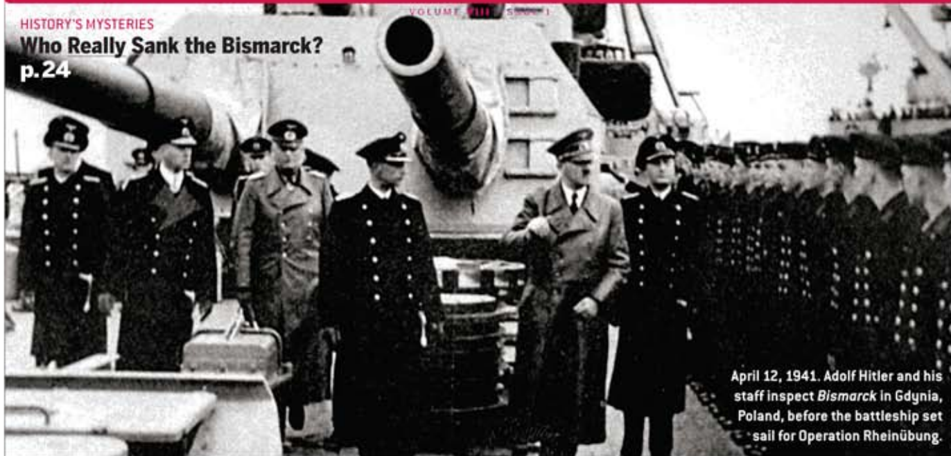
April 12, 1941. Adolf Hitler and his staff inspect Bismarck in Gdynia, Poland, before the battleship set sail for Operation Rheinübung.