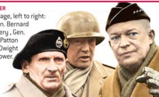
Photo collage, left to right: British Gen. Bernard Montgomery, Gen. George S. Patton and Gen. Dwight D. Eisenhower.