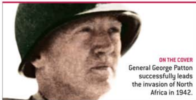
ON THE COVER General George Patton successfully leads the invasion of North Africa in 1942.